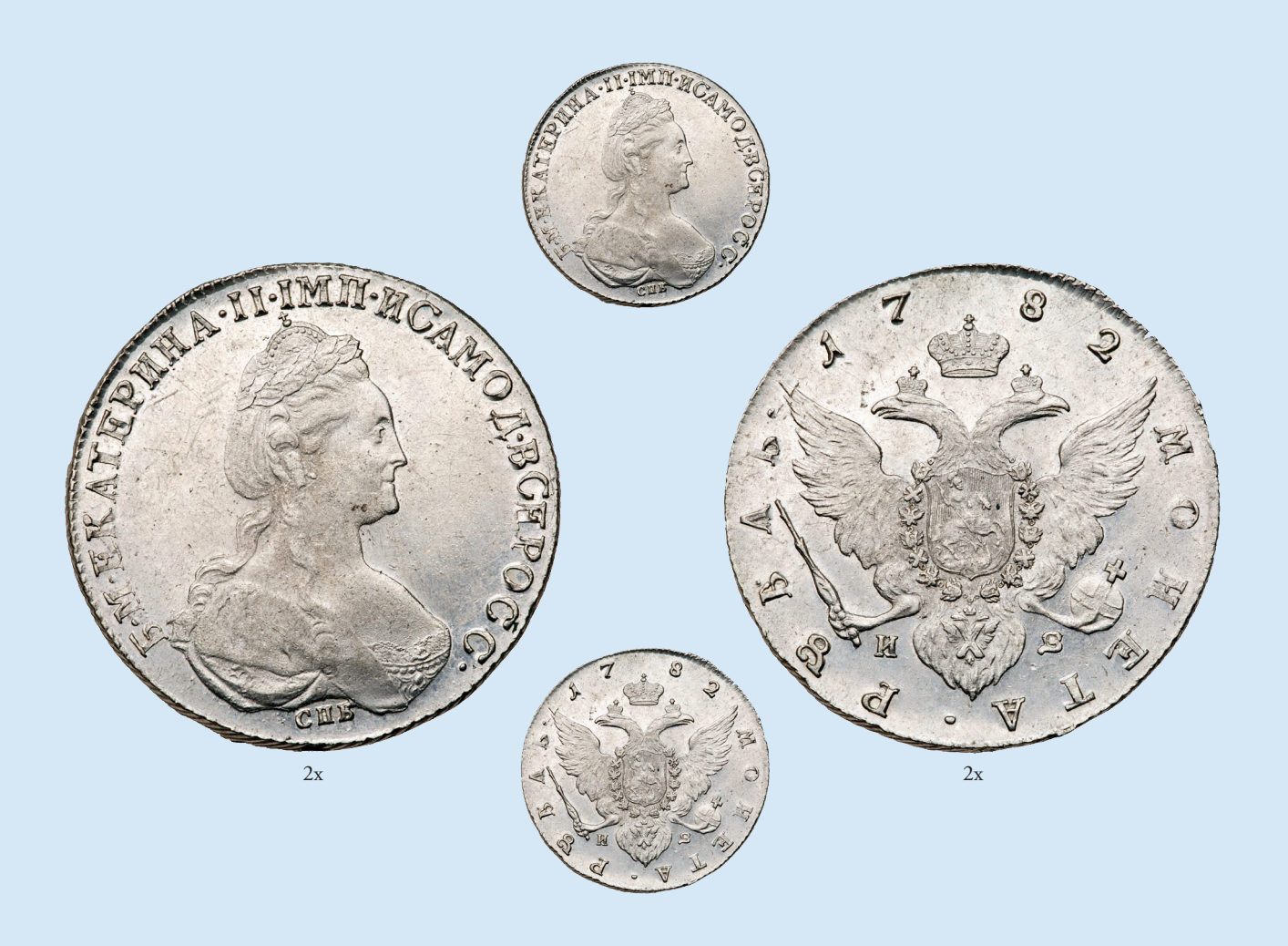
2073 Rouble 1782 СПБ-ИЗ. 24.12 gm. Bit 233, Diakov 437, Sev 2186 (S), Uzd 1121. Snowy white over some old obverse hairlines' reverse hairline scratch. Lustrous. Uncirculated.