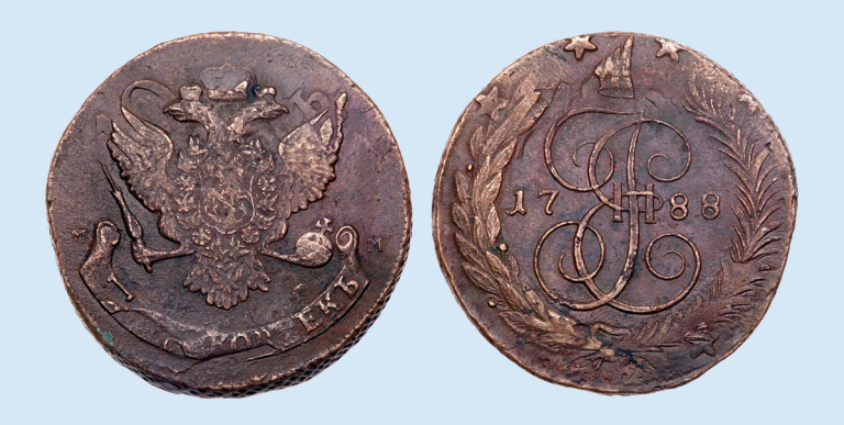
2075 5 Kopecks 1788 MM. "M M" at sides of the eagle. 52.6 gm. Bit 527 (R1), B 272 (R), Ilyin (10 Rubl.), Petrov (10 Rubl.). Overstruck on a 1762 10 Kopecks with snippets of the undertype visible. Very rare . A most pleasing example. Extremely fine.