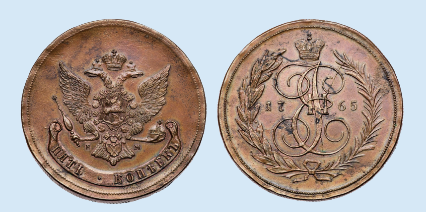
2074 5 Kopecks 1765 EM. Novodel. 77.3 gm. Bit H655 (R2), Brekke –unlisted as edge 3. Apparently and curiously the only listing for this piece with this edge is Bitkin's. A very rare and very heavy Novodel. Some die flaws. Toned. Uncirculated.