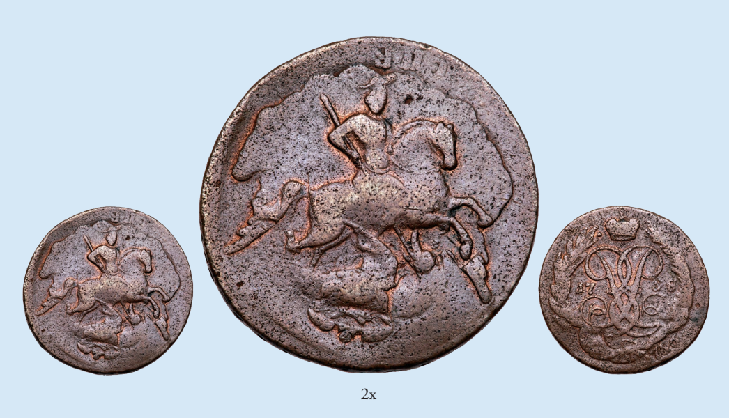
2061 2 Kopecks 1758. Cf. Brekke/Bakken Supp. P. 98; Bit type 470, Brekke type 98. Edge 5. Struck over a "Baroque" Kopeck 1756. Fine.