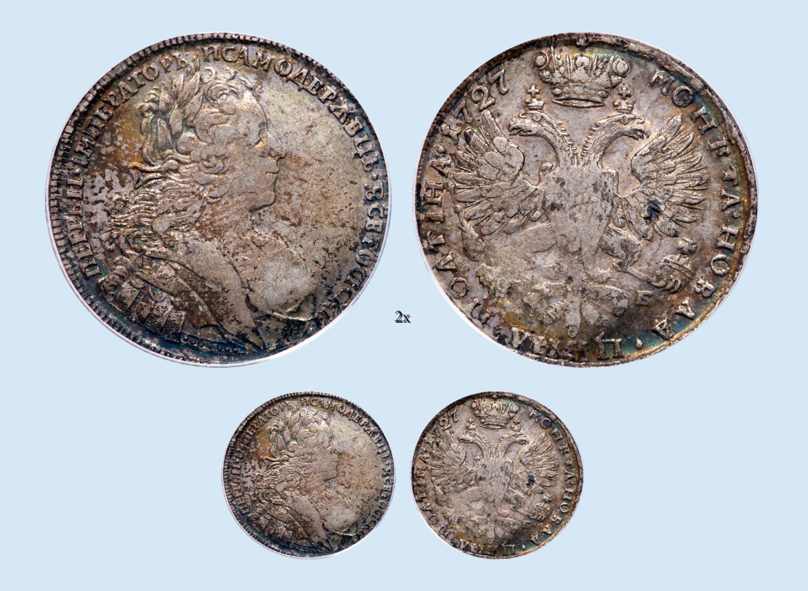
2043 Poltina 1727 CΠБ. Small diamond before date. Variety not listed in Diakov, nor Bitkin. Ilyin (4 Rubl.), Petrov – (6 Rubl.) – for the type. Authenticated and graded by PCGS VF 30. Iridescent peripheral hues. Very fine.