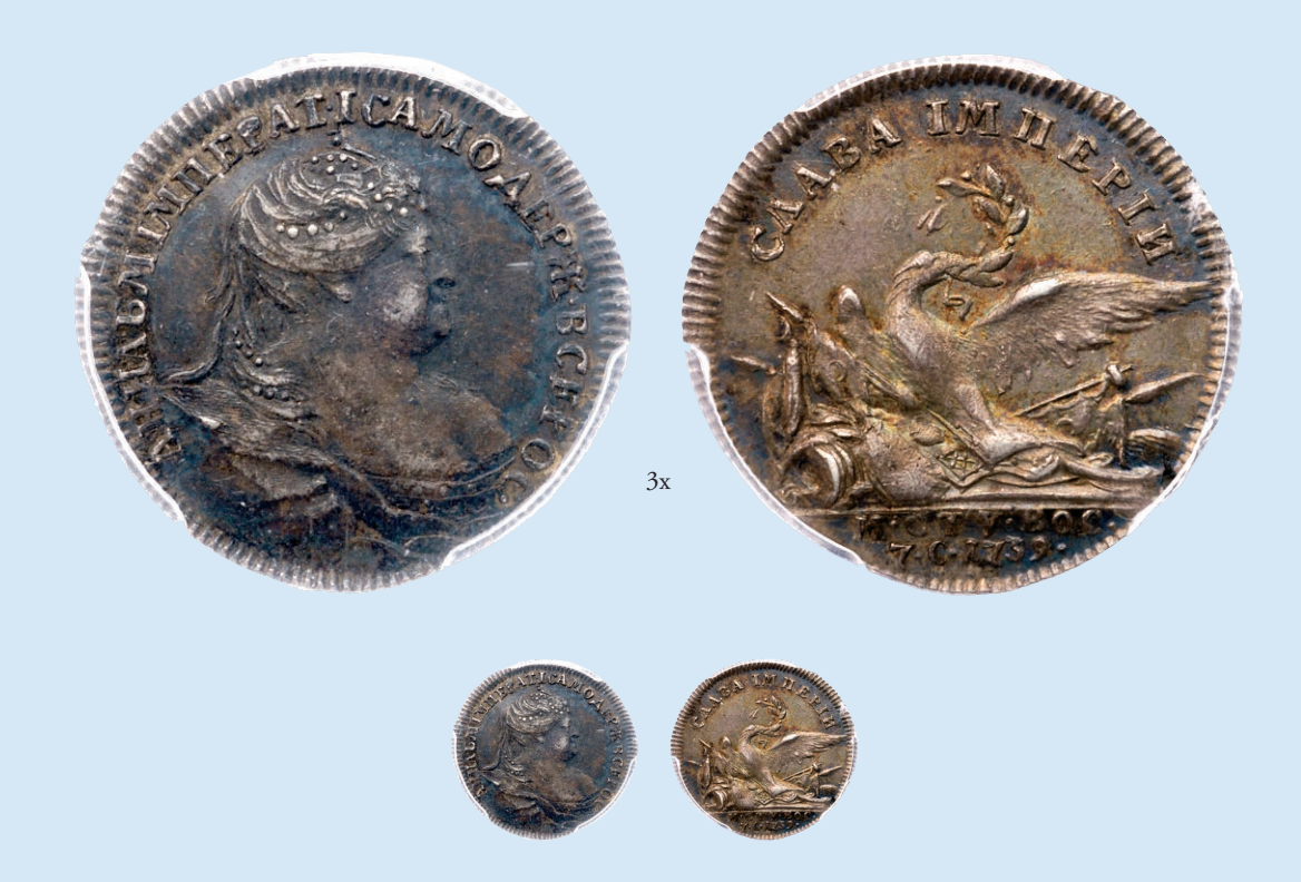
Jetton. 1739. Silver. To Commemorate Peace with Turkey. Bit Ж418, Diakov 81.5, Rud 1739.2. Crowned and mantled bust right / Eagle, wreath in beak, sitting atop a pile of trophy arms. Authenticated and graded by PCGS AU 53 (#528711). Rich old deep gray tone. About uncirculated.