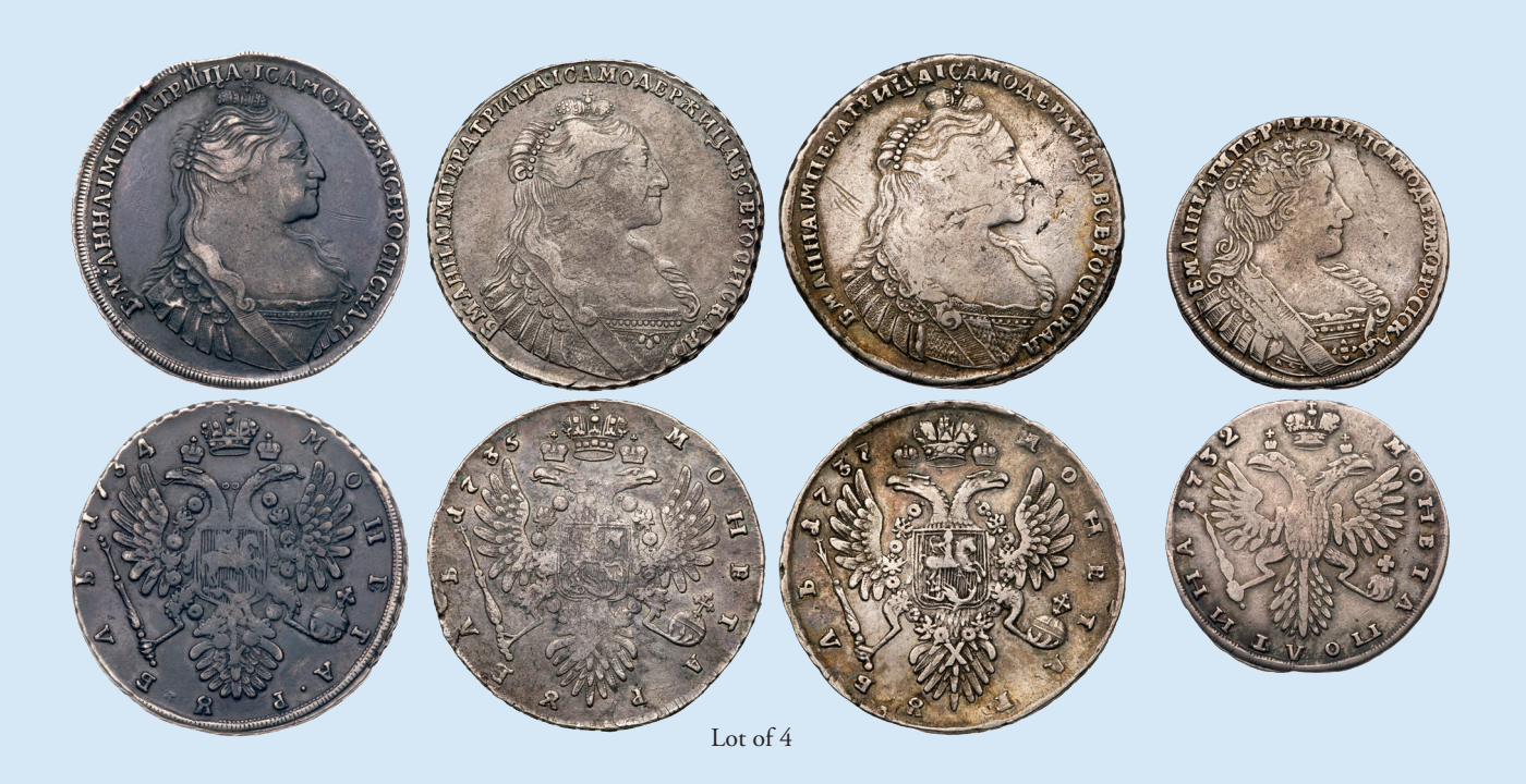
2051 Lot of 3 Roubles and Poltina. Roubles 1734 (obv. scratch, darkened), 1735, 1737 (some old obv. scratches and lamination) Bit 110ff, 121,135; and Poltina 1732 (Small obv lamination). Bit 138ff. About very fine-Very fine. (Lot of 4).