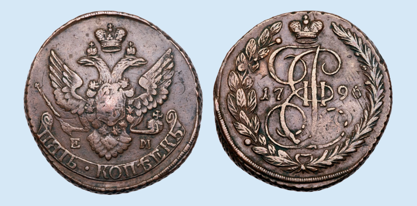
5 Kopecks 1796 EM. 56.73 gm. Bit 109 (R1), B 17. Struck over a 1762 10 Kopecks (part of legend visible under cipher). Rare. About extremely fine.