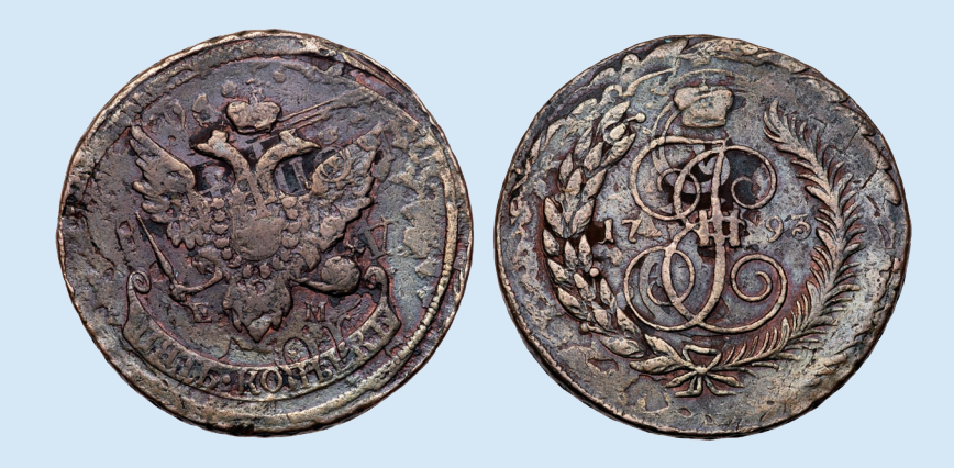
5 Kopeks 1793 EM. 49.05 gm. Bit 102, B 10 (S). Overstruck on a Catherine II 10 Kopecks 1796. The reverse legend of the host coin quite clear on obverse, cipher over previous cipher. Unusually large flan, Impressive Good very fine.