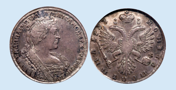
Poltina 1733. Moscow, Kadashevsky mint. Bit 146, Diakov 7, Sev 1112. Authenticated and graded by NGC XF 45. Pearly medium-gray, good lustre. Choice extremely fine.