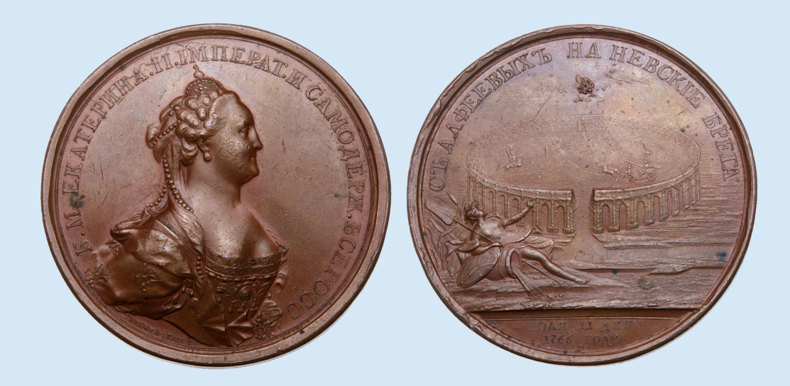
2089 Court Carousel 1766. Medal. Bronze. 65 mm. By T. Ivanov. Diakov 131.1, Reichel 2324. Crowned and mantled bust right / The carousel, in the foreground, the rivergod Neva reclining on a shield bearing the Arms on St. Petersburg, eagle, wreath in beak, above. Deep chestnut-brown.