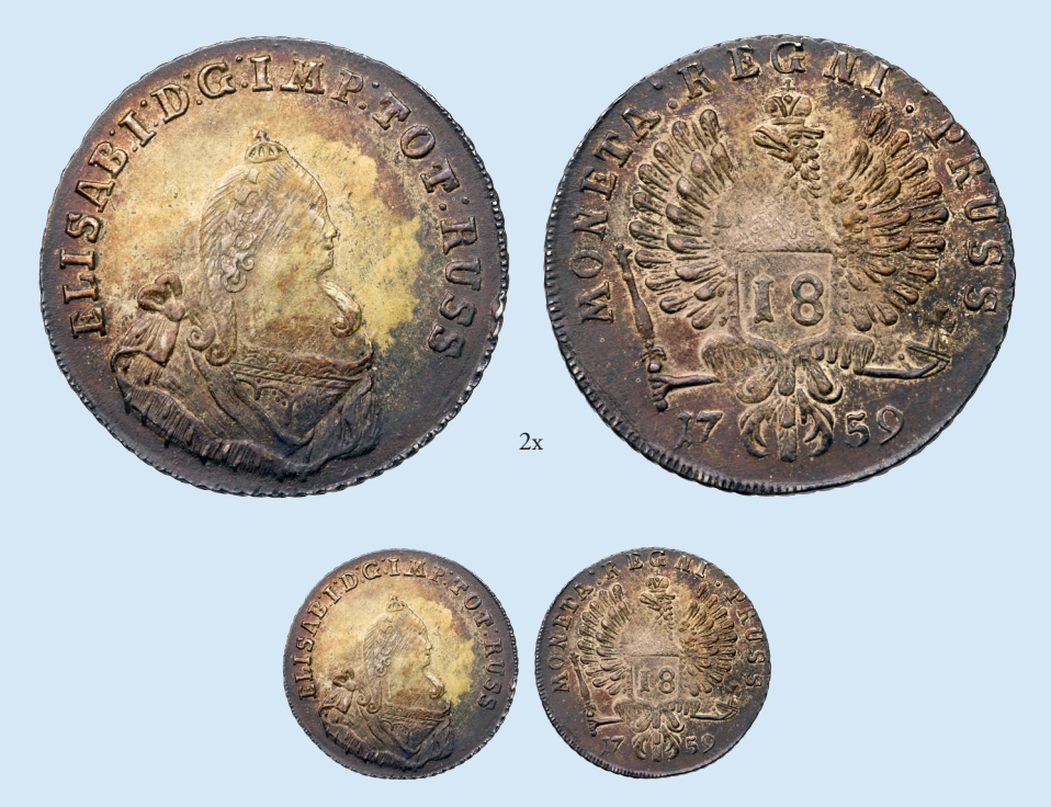
2062 18 Groschen 1759. Königsberg. 5.37 gm. Obverse legend starts high, Elizabeth's crown points between colon and I in D:G:IMP. Olding 453a, Bit 677v (R1) Diakov 629 (R1), Ilyin (8 Rubl.), Sev 1814 (R), Uzd 4866 (R). Deep iridescent toning. Some weakness at centers, otherwise bold. About uncirculated.

Ex "The New York Sale" XXXVI. Jan 6, 2011, lot 1102, comes with tag