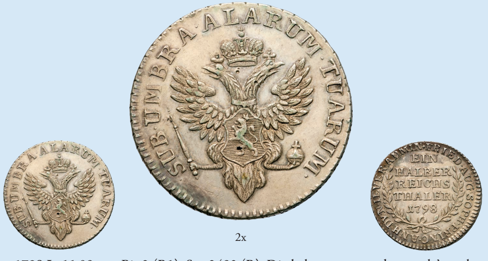
2097 ½ Taler, 1798 J. 11.09 gm. Bit 2 (R1), Sev 2493 (R). Dig below crown and on eagle's neck. Lovely pale blue-white tone. Uncirculated